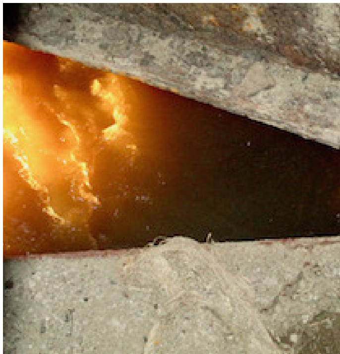
Fire in the water. By Saw Sein Min