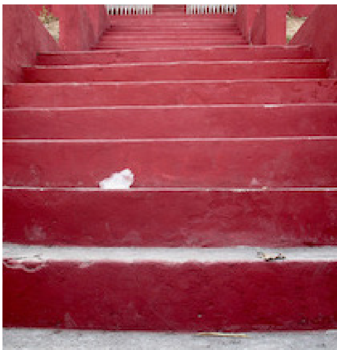
The day that we went to pagoda. By Eh Gay Wah