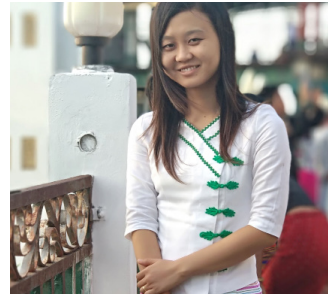
Eh Gay Wah