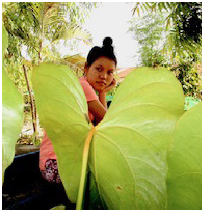
Can you see me? By Ngwe Sein