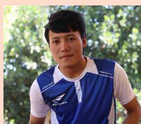
Pray Reh Say